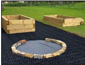
The development of Ninian's Community Garden