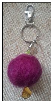
Below right: Felted animals.