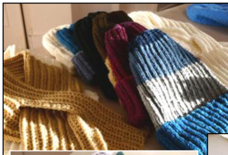
Left: Woolly hats knitted for Seafarers