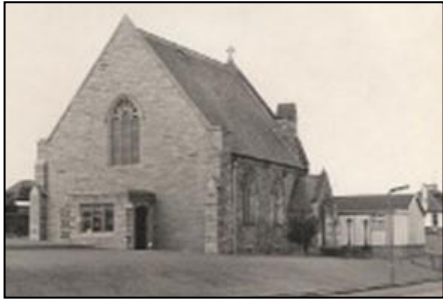
St Ninian's Prestwick

Numbers attending in person in both places were in the mid-thirties. This is very similar to St Ninian's Troon. The configuration of seating made St Ninian's a different experience from Holy Trinity. As at St Ninian's Troon